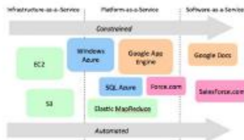
Figure 4. Cloud computing service types

c) Infrastructure as- a- service (IaaS) low-level service for basic storage and computing. Verities of service are now available. Ex. Google compute engine. Infrastructure as- a- service offer additional resources such as virtual machine disk image library, raw and file based storage, firewalls, load balancers, IP address, virtual local area network and software bundles. IaaS-cloud providers supply these resources on-demand from their large pools installed in data centers. For wide area connectivity, customers can use either the internet or carrier clouds.