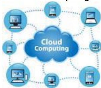
Figure 2. Cloud Computing